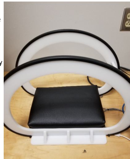
Figure 1. Study device